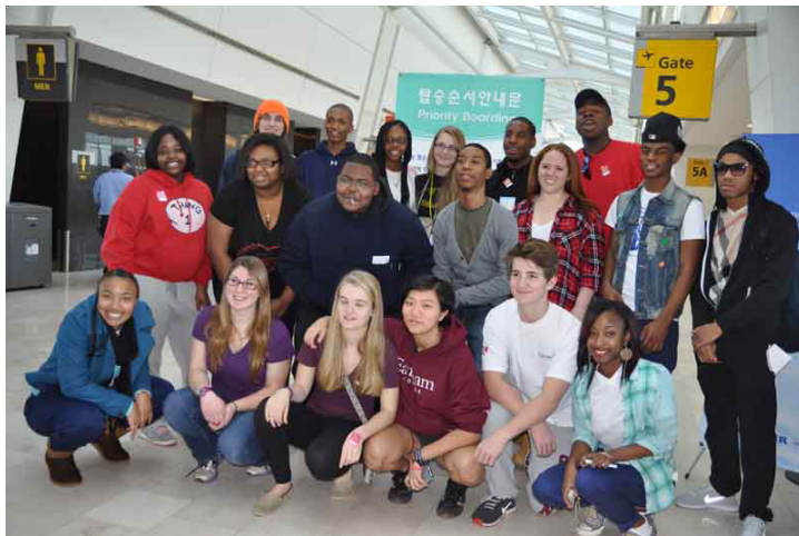
Pictured, above: Nineteen youth Ambassadors, representing the NYAC, went a mission to Cambodia recently. They are pictured at JFK, just prior to departure.