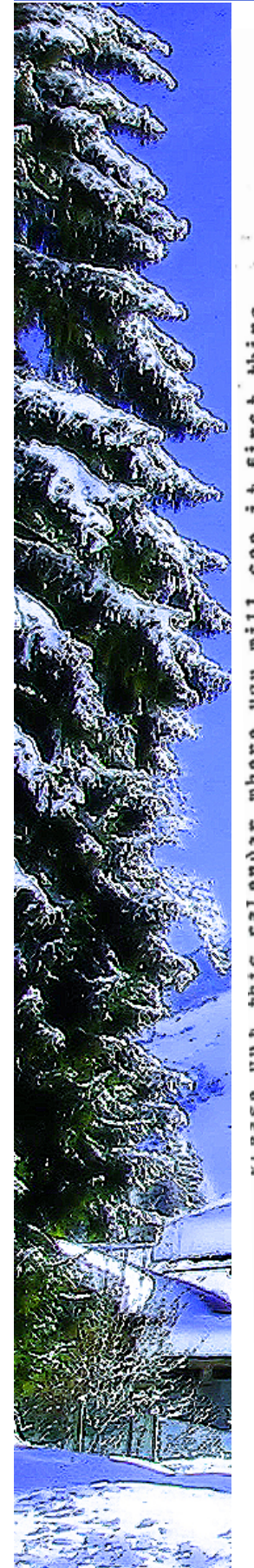
riease pur this calendar where you will see it first thing in the morning. It's purpose is just to remind us that each day is special and to put some thought into it.

"This is the day the Cord has made - REJOICEI"