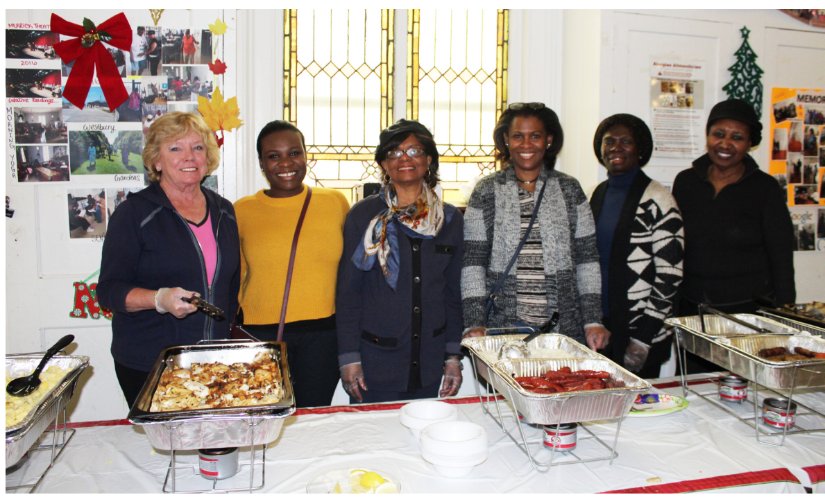
Pictured above: The lovely volunteers of the Hempstead Fellowship Brunch came to serve guests at the event.