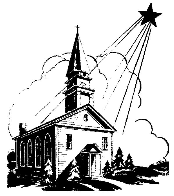
Celebrating 195 Years of Service