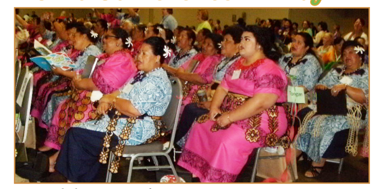
{\it Pictured\ above:\ UMW\ from\ Tonga.}

The General Assembly of UMW Gelebrates 150 Years At Ohio Conference in May