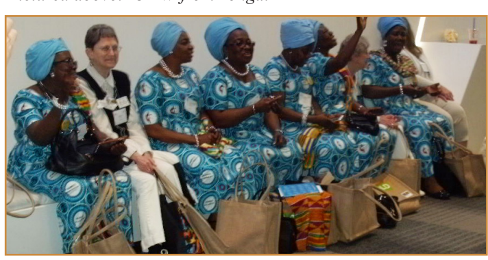
Pictured above: UMW from Ghana.