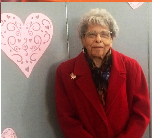
Pictured, left: The United Methodist Women met recently to plan for future missions and events to help women and youth.