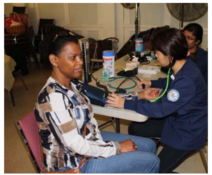
Blood pressure screening services were on hand for guests.