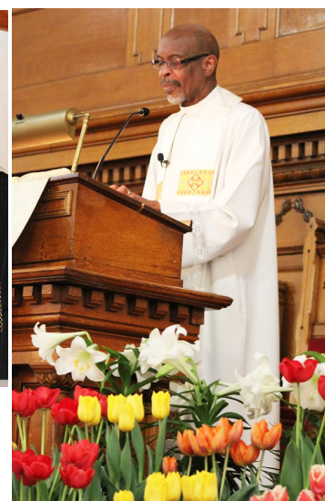
Pictured, (Left and below right): Palm Sunday Service.