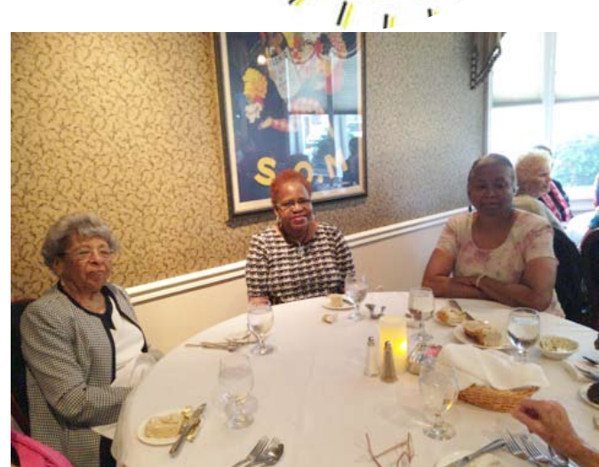
Thirty-two members of the UMC of Hempstead attended a delightful and delicious Spring luncheon on June 10th, held at the Davenport Press Restaurant in Mineola. It was sponsored by the Hempstead United Methodist Women.